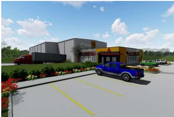
[Haines City – Sika Admixture Facility Groundbreaking 3D Rendering]

Haines City, FL – September 5, 2024 — The Economic Development Council of Haines City proudly announces the groundbreaking ceremony for Sika's new facility at 2501 State Route 544. This new development will be instrumental in expanding Sika's production capabilities for concrete admixtures, contributing to the growth of the local economy and supporting sustainability initiatives.